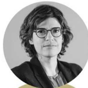
Tinne Van der Straeten